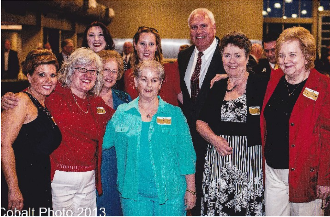
Republican Women at the The 2013 Lincoln Reagan Day Dinner Dance Friday June 21, 2013 Wilma Rudolph Event Center at Clarksville's Liberty Park.

NATIONAL FEDERATION REPUBLICAN WOMEN CONVENTION Friday—Monday, September 20—23 37 th Biennial Convention, Galt House, Louisville, KY