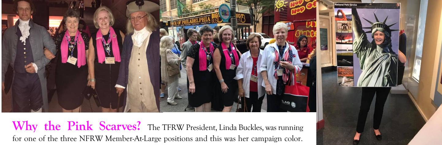
ntionld be was posit