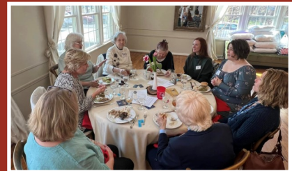
County Mayor Wes Golden