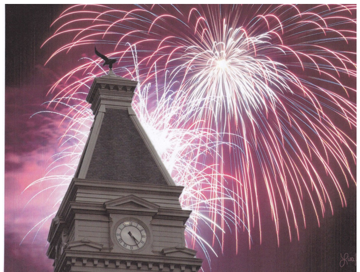
Cover of our Cookbook